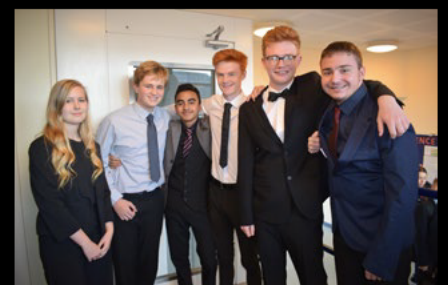
YEAR 11 INTERVIEWS