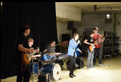
NEATHERD'S GOT TALENT