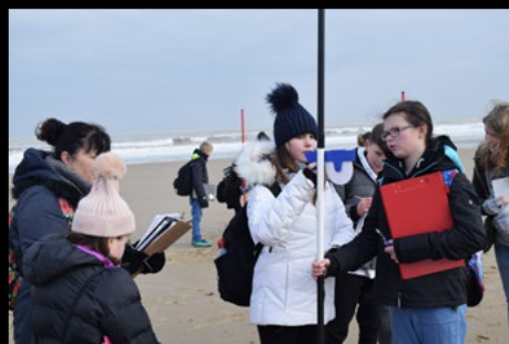
FLEXIBLE LEARNING DAY