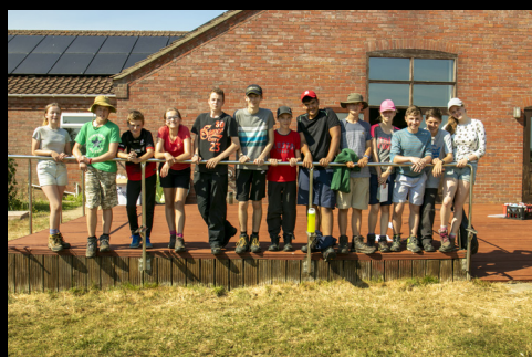
DUKE OF EDINBURGH