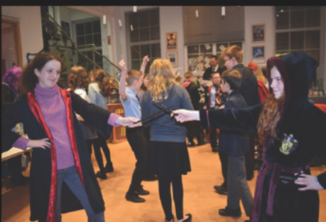
HARRY POTTER NIGHT