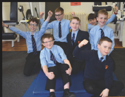
FLEXIBLE LEARNING DAY